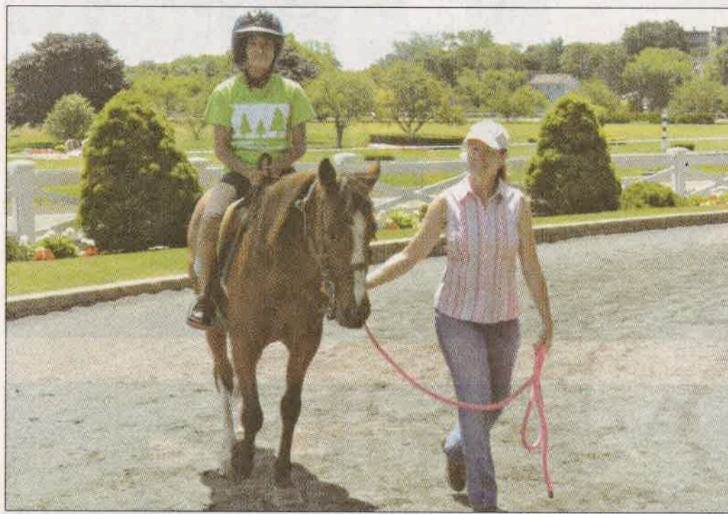
An East Boston YMCA camper takes a ride on her favorite horse.

"This is an eight week commitment so it's basically all summer and it's something the kids that participate look forward to all week," he said.